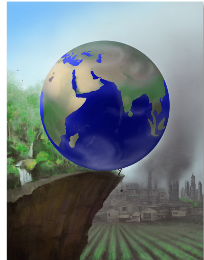
Illustration by Cheng (Lily) Li

By the time today's children reach middle age, it is extremely likely that Earth's life-support systems, critical for human prosperity and existence, will be irretrievably damaged by the magnitude, global extent, and combination of these human-caused environmental stressors, unless we take concrete, immediate actions to ensure a sustainable, high-quality future.